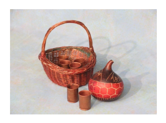
DRINK VENDOR BASKET, GOURD, COPPER CUPS