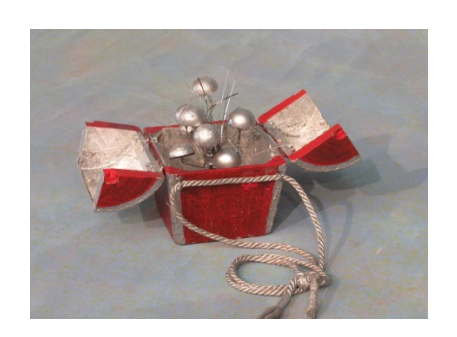
MAGIC BELLS (open)