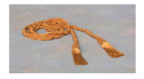
GOLD ROPE with tassels