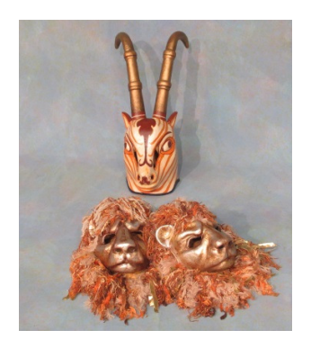
MASKS--ANTELOPE AND LIONS