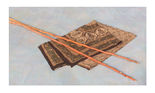
THEATER CURTAIN AND POLES