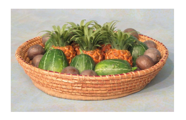
VENDOR BASKET 2