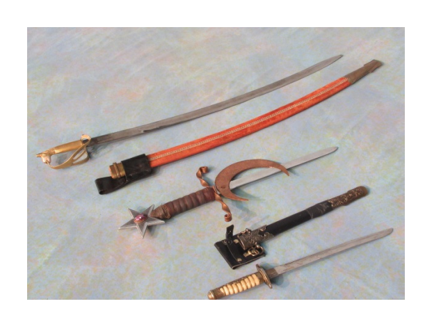
TAMINO SWORD AND DAGGER, QUEEN DAGGER