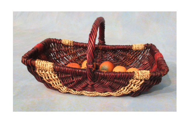
VENDOR BASKET 5