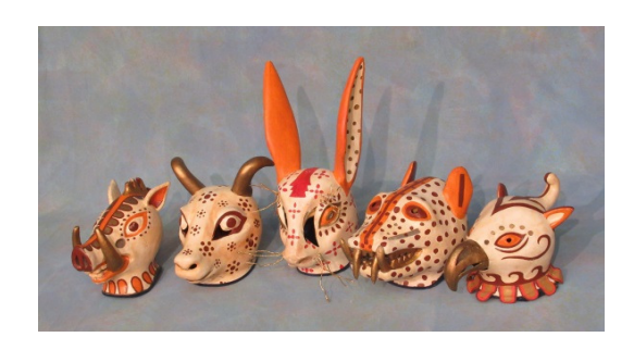
MASKS--BOAR, GOAT, RABBIT, BOAR, BIRD