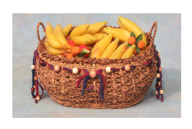
VENDOR BASKET 6