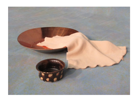
FOOT WASH BASIN, SCOOP, TOWEL