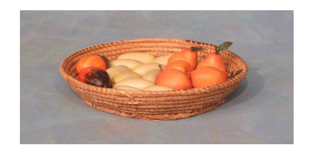
VENDOR BASKET 4