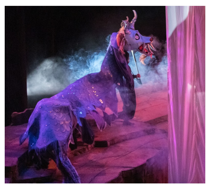
DRAGON on set