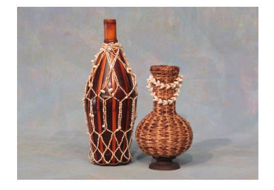
SHELL DECORATED CONTAINERS