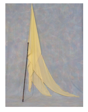
BAMBOO POLE (16) with FIRE FLAG (10)