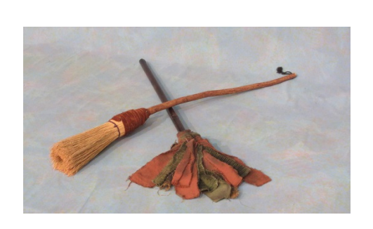
BROOM and MOP