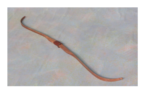
BOW (no string)