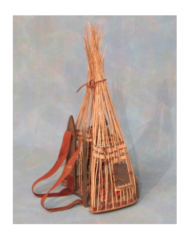
BIRDCAGE BACK PACK