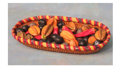
VENDOR BASKET 1