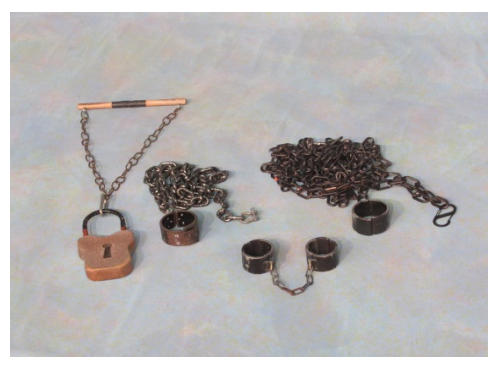
MOUTH LOCK, ANKLE SHACKLES WITH CHAINS, WRIST SHACKLES