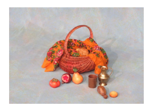
PICNIC BASKET, CLOTH, FOOD, BRASS PITCHER, COPPER CUP