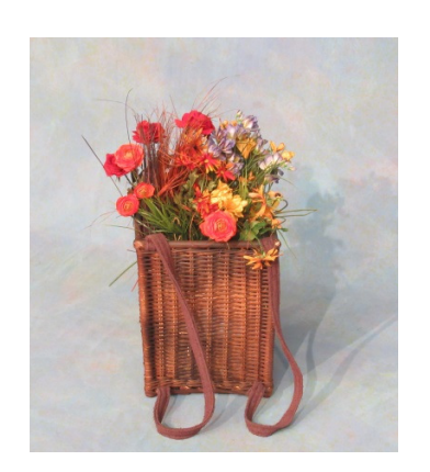
FLOWER VENDOR BASKET with LOOSE FLOWERS