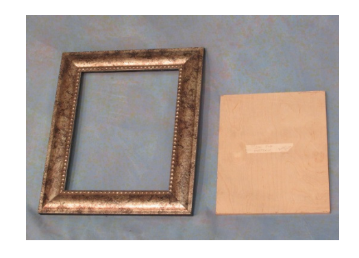
POTRAIT FRAME, JIG