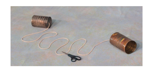
TIN CAN PHONE, SCISSORS