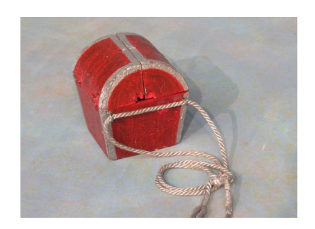
MAGIC BELLS (closed)