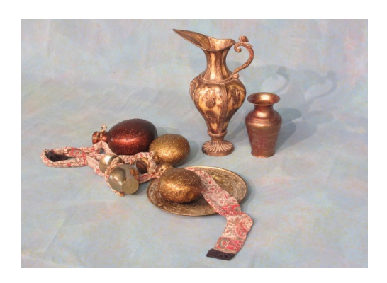
BRASS VENDOR SASH, PITCHER, URN