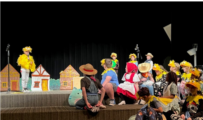
Highland Park Elementary in Salt Lake City presents their original opera, The Interrupting Chickens .

In addition to fostering valuable life skills such as collaboration, critical thinking, and creativity, Music! Words! Opera! aligns with each of the four strands of the Music Fine Arts Core Standards (Create, Perform, Respond, and Connect) as well as many of the Drama Core Standards. Teachers also utilize the program as a cross-curricular activity by aligning the subject matter of their original opera with another non-arts learning objective (ex., one school this year used the program to add music performance elements to plays created and presented by students centered around Greek history and mythology).