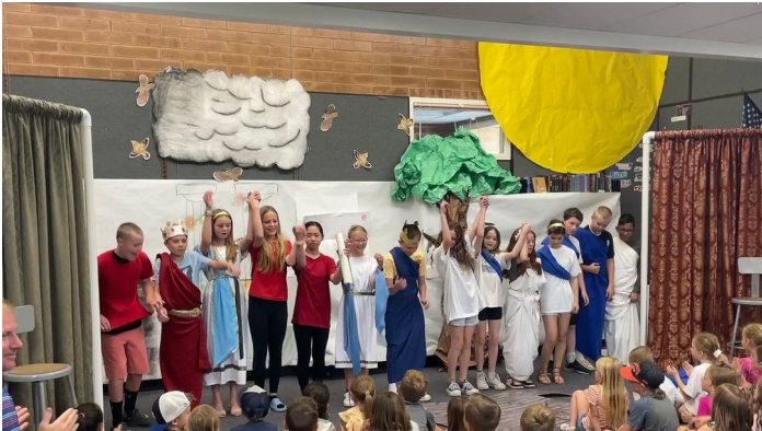
Sixth grade students at Jordan Ridge Elementary in South Jordan take a bow after their performances of stories from Greek mythology.

“The opera is fun! I like when we all sing together because it sounds good.” –Student, Highland Park Elementary