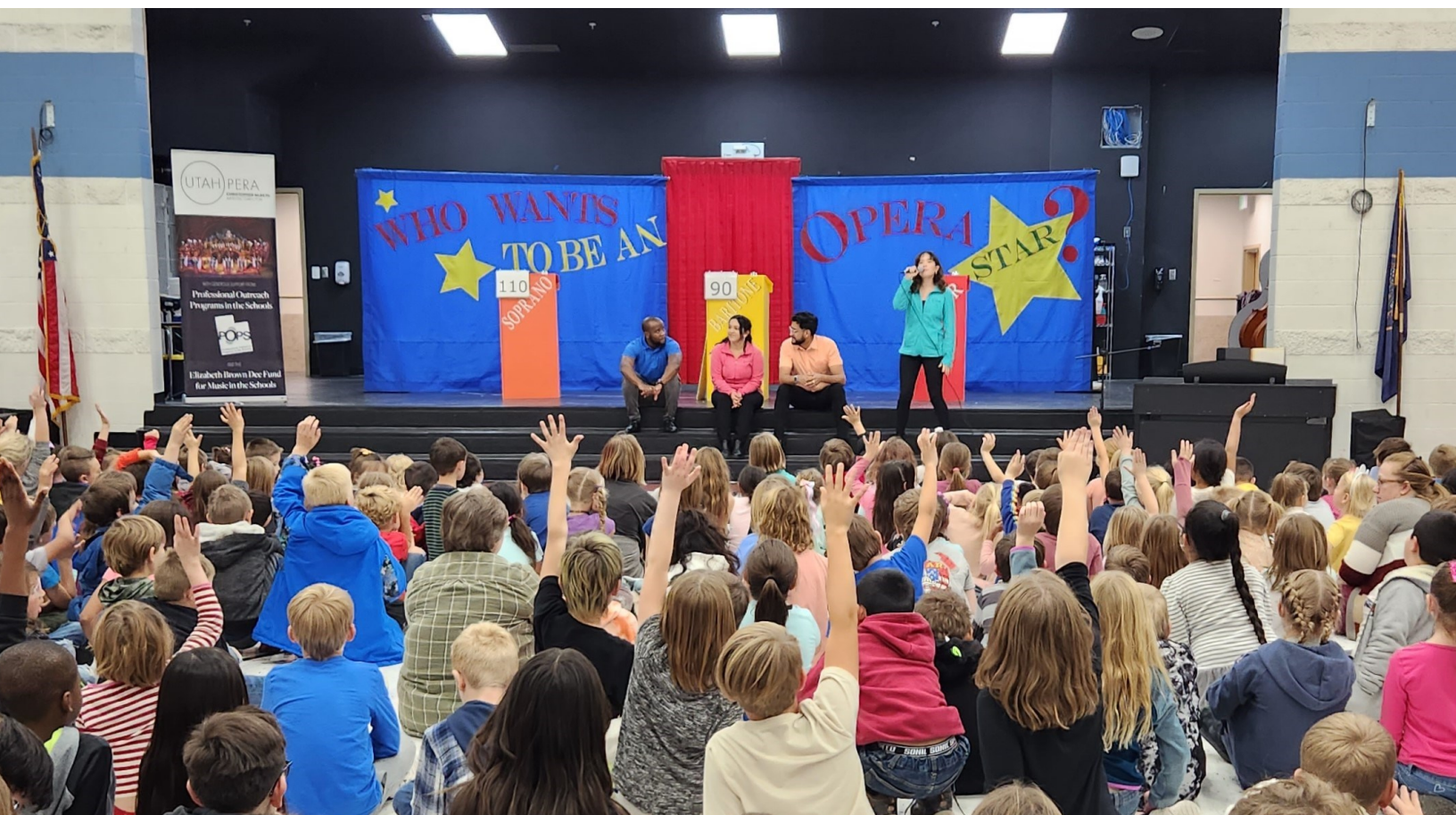
Students at Gateway Preparatory Academy in Enoch eagerly come up with questions to ask after a performance of Opera 101 . Utah Opera Resident Artists performed both Opera 101 and Who Wants to Be an Opera Star? at this school.

Core Standard Music Lessons bring a Utah Opera Resident Artist singer digitally into the classroom for a 20-minute presentation. The singer presents two contrasting arias from the opera repertoire and leads a discussion with the students as they identify the emotions of the pieces and specific musical elements (such as tempo, dynamics, melody, and rhythm) the composers employed to convey that emotion. This program is developed specifically to assist students in identifying and describing elements that make contrasting music selections different from each other while also providing the opportunity for students to interact with a style of music with which they may have little to no prior experience.