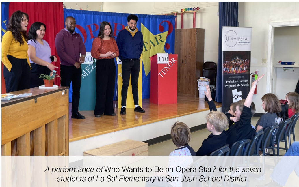
A performance of Who Wants to Be an Opera Star? for the seven students of La Sal Elementary in San Juan School District.

The Who Wants to Be an Opera Star? program is an assembly-style offering for grades K-6 in the form of a highly engaging game show presented by the Utah Opera Resident Artists. The 50-minute long scripted presentation is created as an accessible introduction to the operatic art form, organically presenting educational material amidst musical examples and student participation. The presentation ends with an opportunity to validate students' curiosity in an open Q&A session.